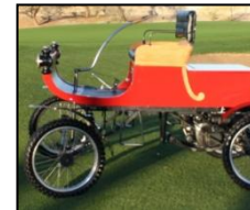
1901 Oldsmobile ARC's 1 st Project

ARC was created in November 2011 with the defined purpose of charitable and educational work as determined by the IRS under section 501 (c) (3). We find that our membership is a diverse group of almost 400 active senior adults who have a passion for restoration. Thus far, ARC has been instrumental in supporting and hosting a wide variety of Valley events. That is all because we combine the best of our heart for charity with our knowledge base in restoration work to bring a unique experience to our members and our community.