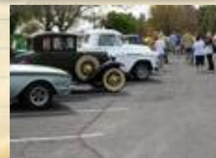
Picnic Car Show