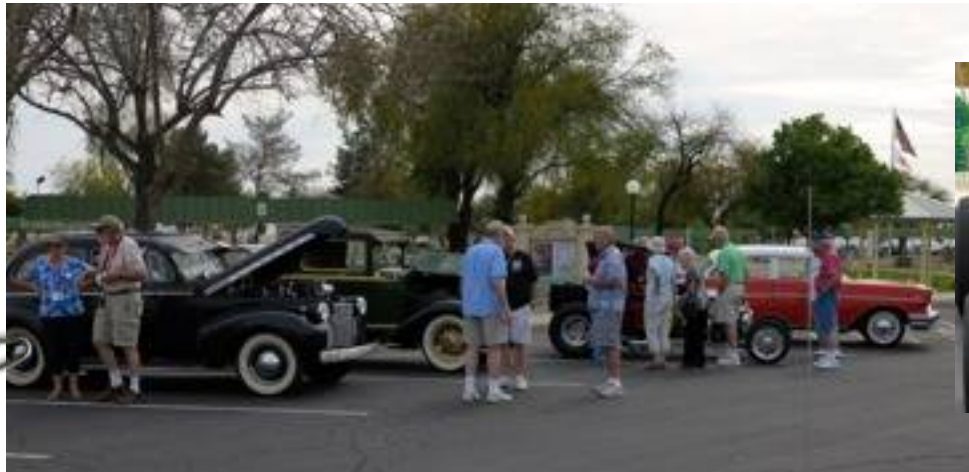
Classic "Rides" at the picnic