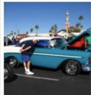
Cars at the 2013 Car Show & Swap Meet