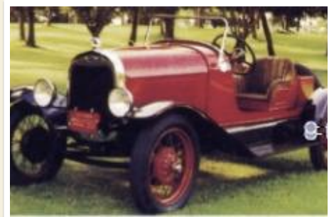
The Speedster owned by Don and Linda Kloth

The race is on to make the completion date. Once completed, the team will drive the car around the area to work out any bugs. The plan is to test drive the Speedster from SCW to St. Louis sometime in April. This is a test for overall endurance (car and man). A pre-race is planned for May 1st - 3rd. This