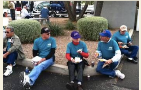
Enjoying lunch at the "Rock Around the Block Tour"