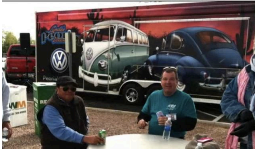
"Rock Around the Block Tour" at Lunde's Volkswagen.