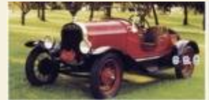
Don's 1930 Model A Speedster