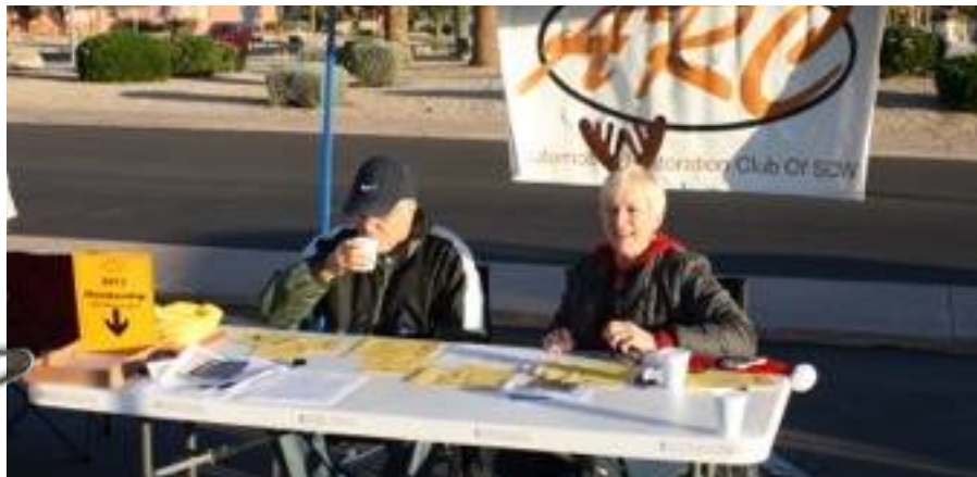
Rock Around the Block Tour 2013