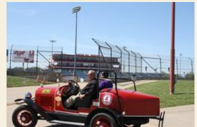
LUCAS OIL RACE TRACK