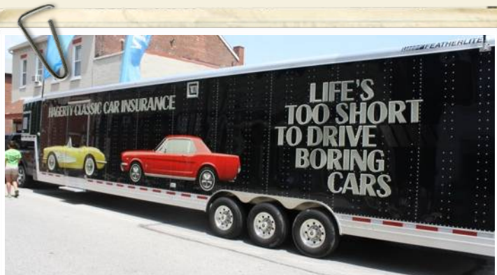
Hagerty's truck at the GREAT RACE

The next ARC General Meeting will be October 15th at 2:00 PM in Summit Hall B at Palm Ridge Rec Center