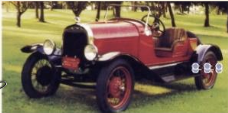
1930 MODEL A SPEEDSTER